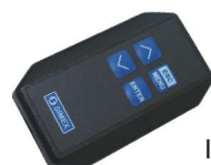
IR programmer SIR-15